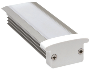
shown with closed end cap